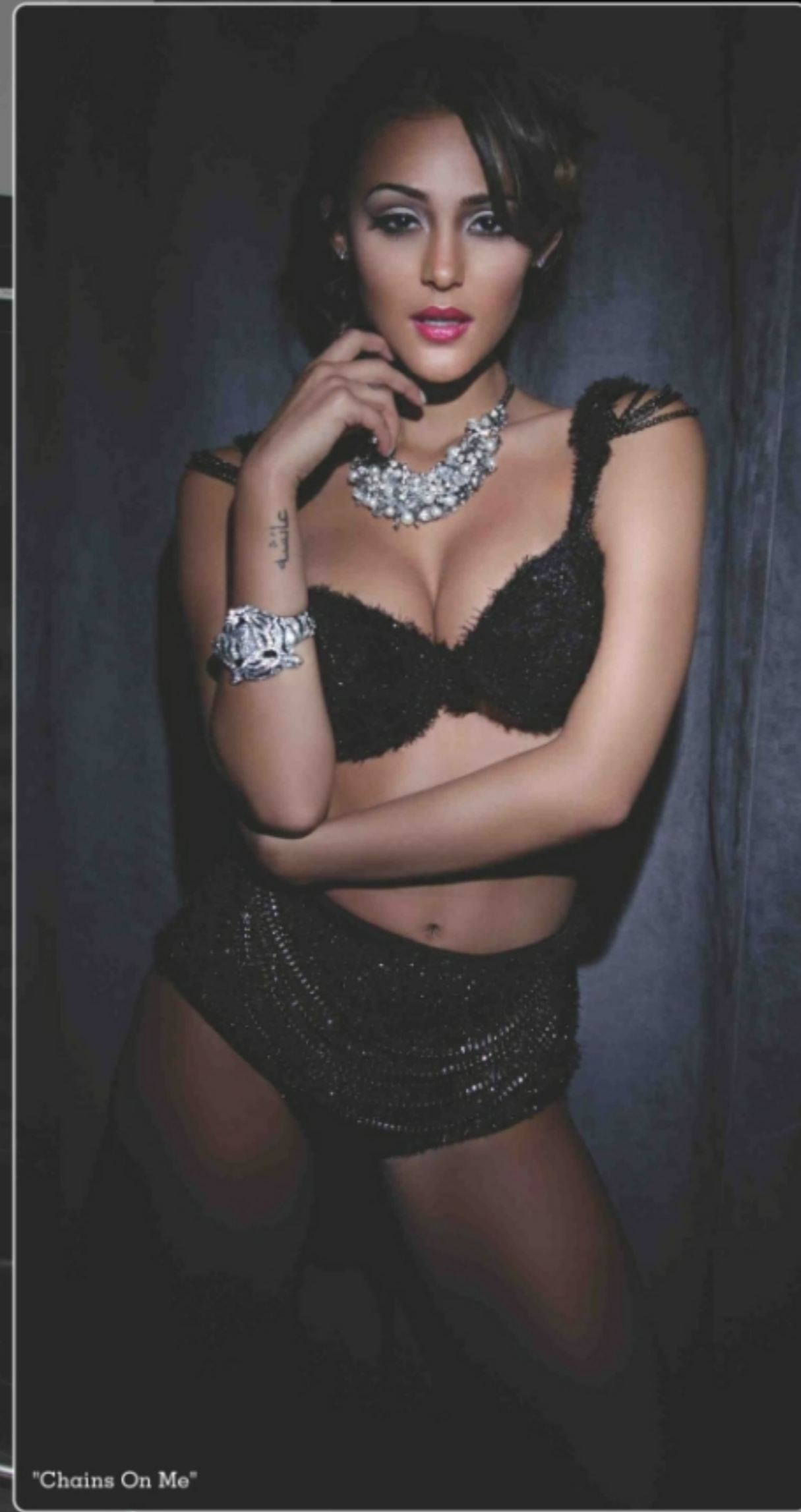
"Chains On Me"

we are custom made. We no longer come in one-size-fits-all. As far as designs go, celebrities sometimes will ask to have the pieces designed a little different. "I don't want my back to show." Or "I want to wear a bra." They'll give me a bit of direction on what they want it to look like, and I'll bring it to life for them.