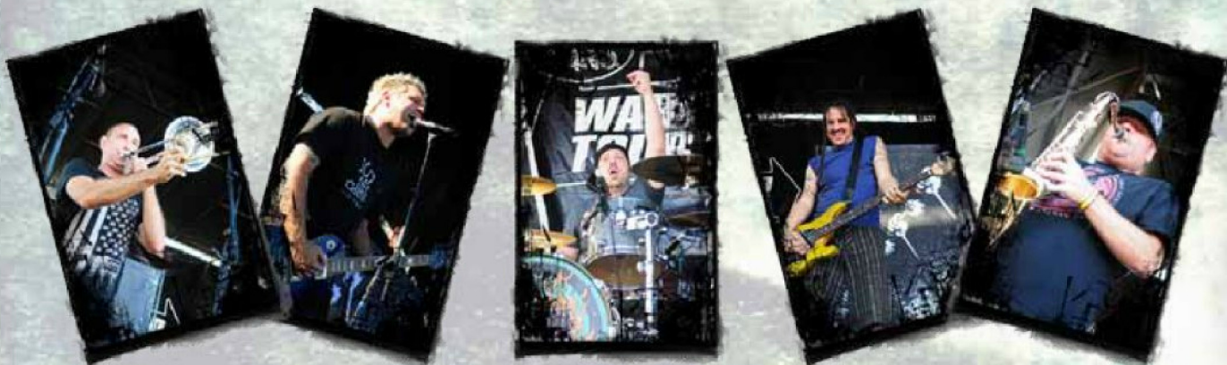
Less Than Jake

For one of the most historic ska-punk bands in history, Less Than Jake's appearance at Warped Tour 2011 was no surprise. Being a staple on Warped Tour for almost as long as it's conception (1995), Less Than Jake have been on the tour since 1997. It's always a pleasure to be graced not just with their presence, but iconic style and sound.